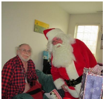
Santa delivered gifts to the residents of the Abbie Hunt Bryce Home during the holidays.

Morning Light, Inc. is the successor to the Visiting Nurse Service Foundation. The organization adopted the Morning Light name in 2014 because “Each new day is a gift for us to appreciate.” We operate the Abbie Hunt Bryce Home , providing free living accommodations for the terminally ill, the only residence of its scope and type in Indiana. We also accommodate homeless patients who need temporary living quarters due to a medical reason. Pennwood Place consists of 35 apartments for low income seniors. We support selected home care patients who need medications, equipment, or utility assistance in conjunction with our former parent company, Franciscan Visiting Nurse Service. We also operate the 4701 N. Keystone office building. Since the fourth quarter of 2017 the building has been more than 50% leased which has produced revenue for charitable activities.